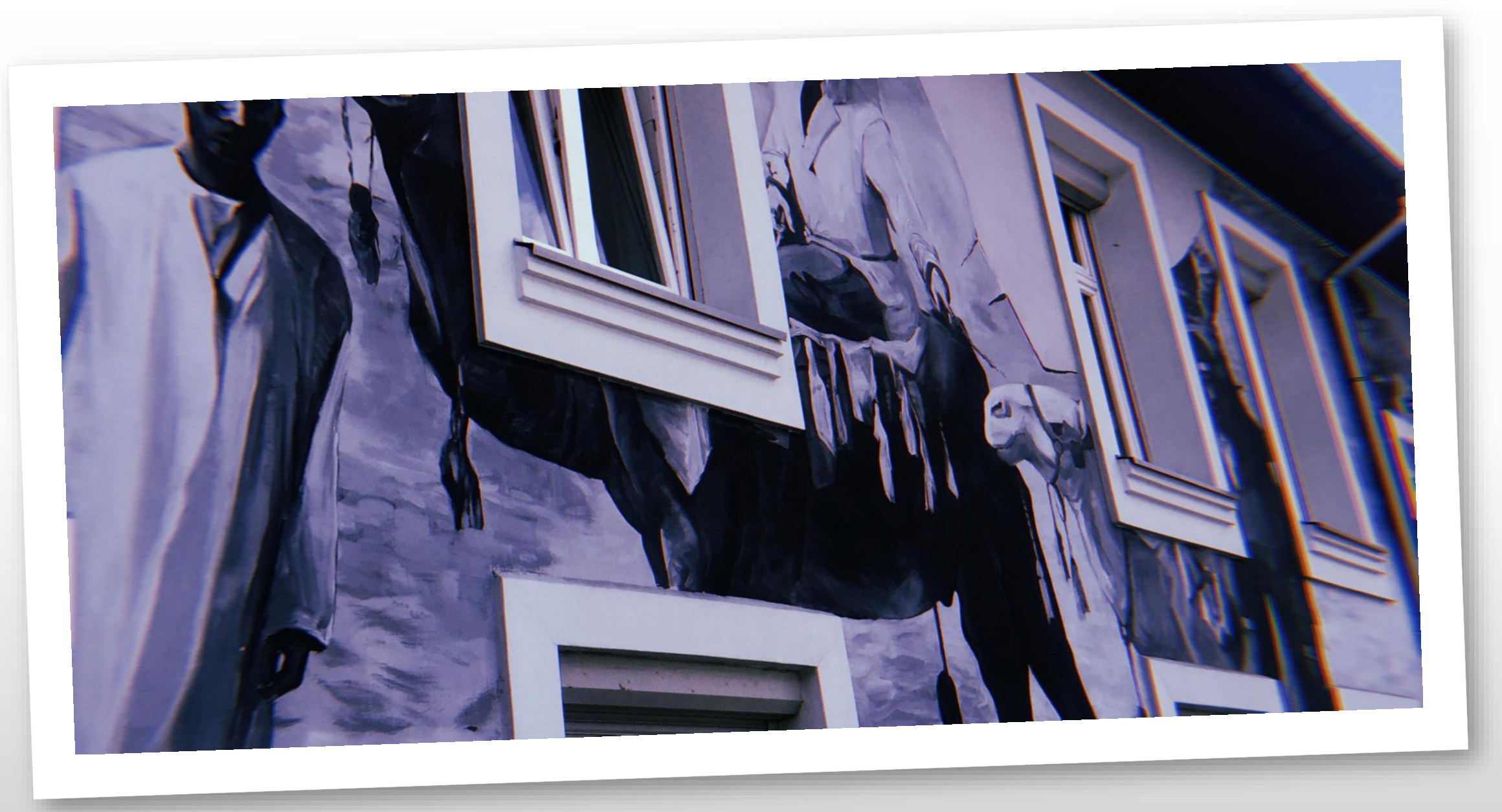
This building was established in 1955 and it was an old hospital from XIX century.