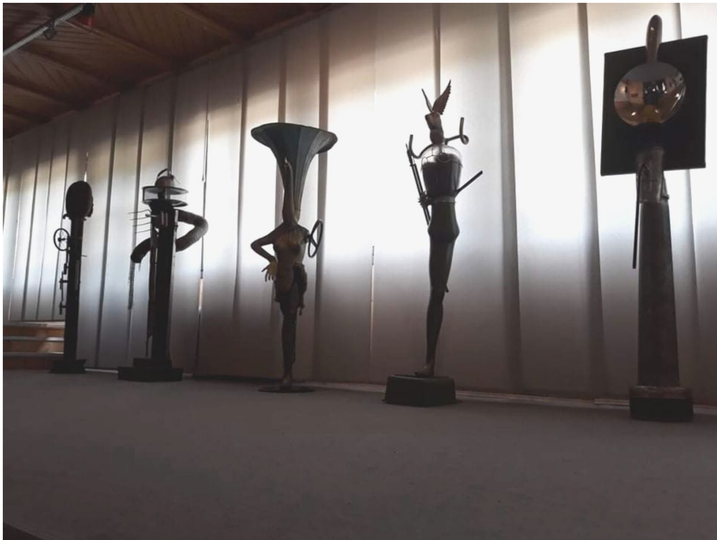
The second floor