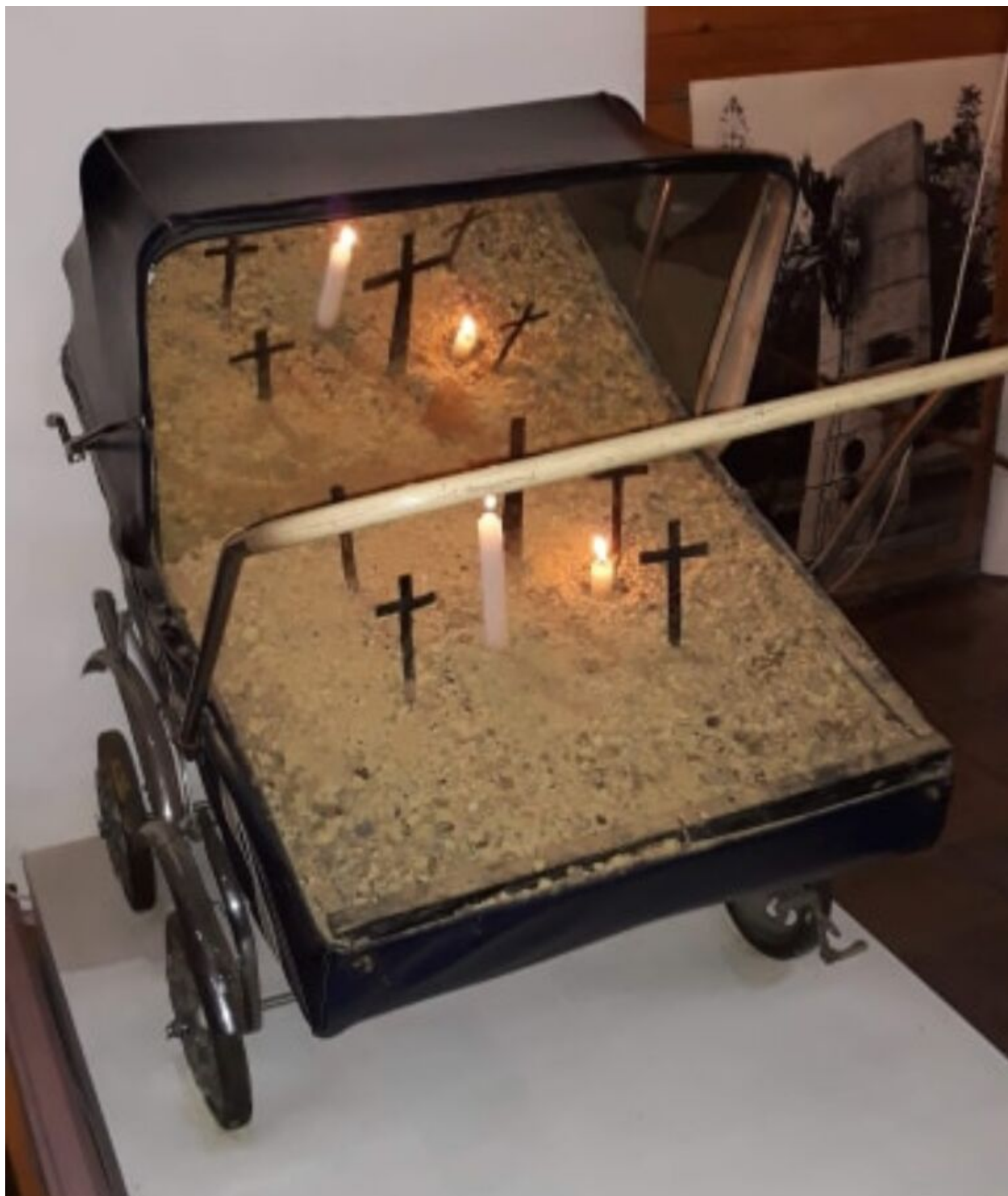
Pamięci Dzieciom Zamojszczyzny 1970